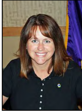
1st Vice-District Governor