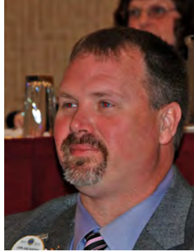
2nd Vice-District Governor