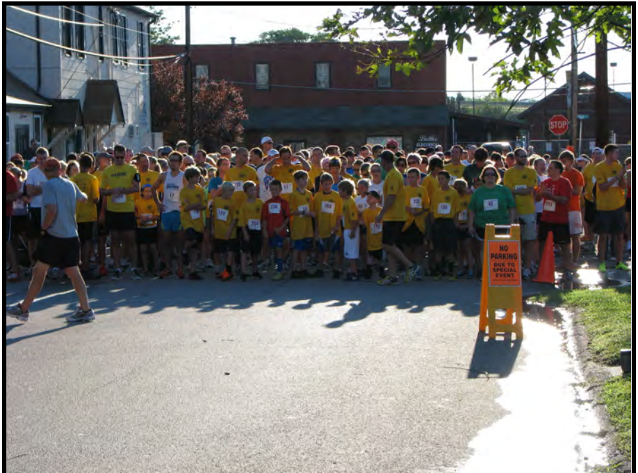
Racers line up for 2012 West St. Louis County Lions Run for Sight. Proceeds were used to help support Lions Eye Care Fund. The 2013 Run for Sight is Saturday, September 7.

It's back-to-school time again, which means preschools, daycares, Head Starts, and Parents as Teachers organizations throughout the state are scheduling Children's Vision Screenings. By identifying children with vision problems early in the school year, we can help them get the eye care they need to learn and succeed in the classroom all year long. We need Lions volunteers to help make these screenings a success. If you're interested, there are a few ways you can get involved: